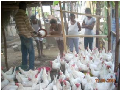
Taking care of the chickens

I would like to thank you for your contributions and efforts to help us in Haiti especially the people in Les Anglais. I want to tell you that I went to PAUP [Port-au-Prince] Friday morning at 2 o'clock in the morning and come back to Les Anglais at 2:30 AM Saturday. I mean this morning to buy the chickens and I get 300 chickens and 17 bags of food of 100 LBS each and I rent a truck to pick up the chickens. Round trips from Les Anglais to PAP from PAP to Les Anglais, we got a very good trip. The most interesting story in that was while I went to PAP a group of young people started working to build the chicken coops in Les Anglais at 7 in the morning they kept working and build two chicken coops until I got back in Les Anglais @ 2:30 Saturday morning. That impressed me that happen the first time in the area see of young people work for so long time during a day and build two chicken coops about 20 hours of work. Number two story the chickens I started laying eggs in their boxes and we arrived Les Anglais we 150 the same day. It is amazing to see that.